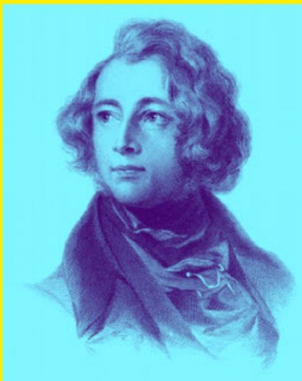
Charles Dickens a founder of Old Ben

National Federation of Retail Newsagents