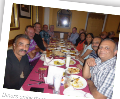
Diners enjoy their meals at the Wessex area committee Curry Night in September.