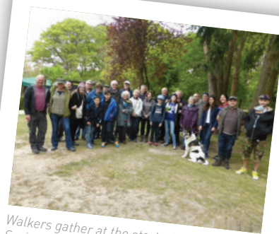
Walkers gather at the start of the Wessex Spring Walk.

We have left mention of the Wessex area committee until last, not because they have done the least in 2017 but quite the opposite. We feared there